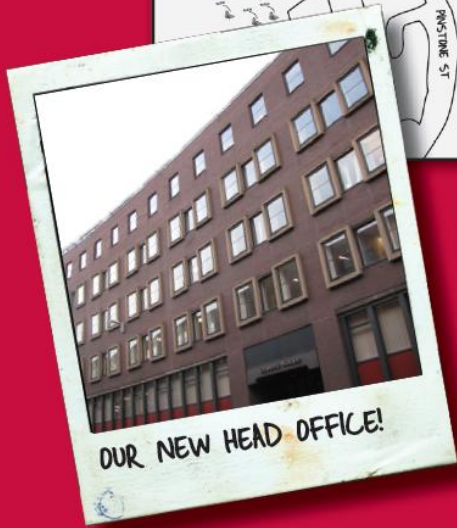
OUR NEW HEAD OFFICE!